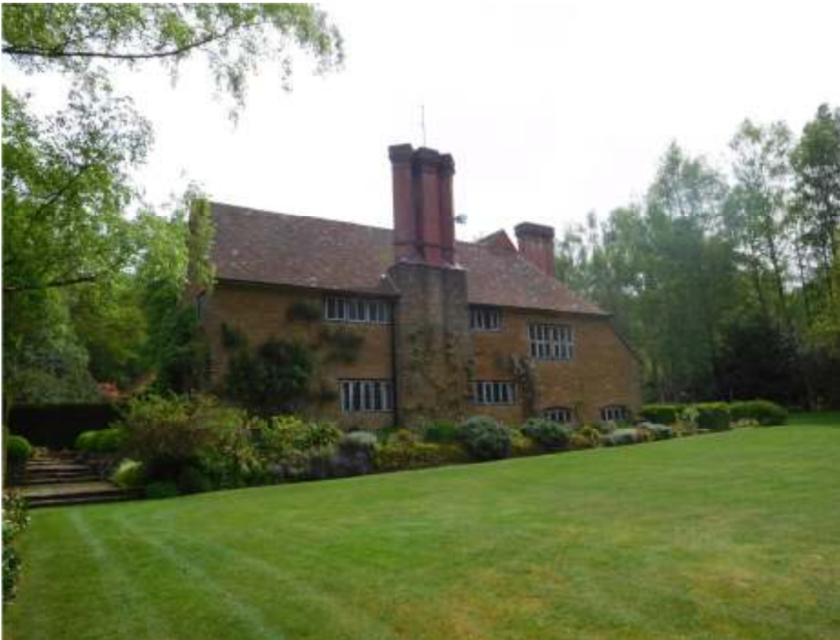
Munstead Wood, designed for Gertrude Jekyll by Sir Edwin Lutyens