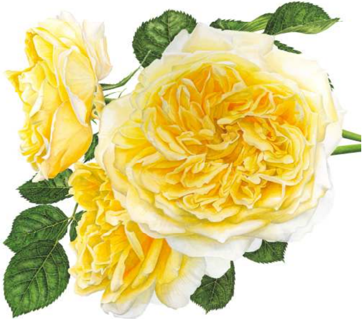
The Pilgrim Rose